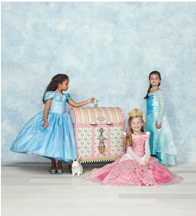
A Disney-themed trunk holds Elsa, Cinderella and Aurora costumes

For the first time, the fantasy his and hers gift is for children, with a set of children's costumes in a Mackenzie trunk, enabling the littlest Neiman Marcus customers to play princess or superhero to their hearts content.