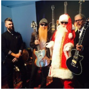
Neiman Marcus fantasy gift unveiling 2015