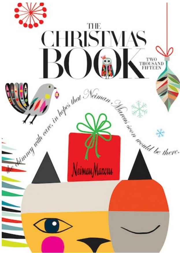
Neiman Marcus 2015 Christmas Book cover

On the inside front cover is an ad from Louis Vuitton. Following that, an introduction explains that the gifts are curated to make a "maximum impact." The retailer also directs consumers to its mobile app to see a surprise gift not available in the print or online editions.