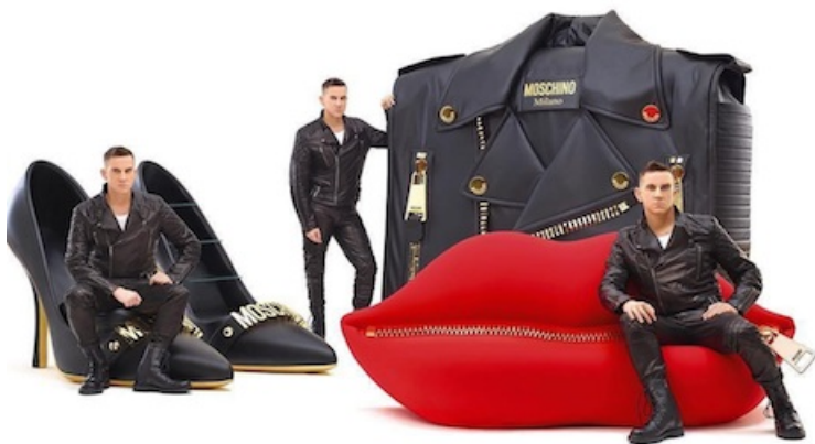
Moschino x Gufram limited-edition furniture collection.

Another common option is to take a classic design and update it for a modern look.