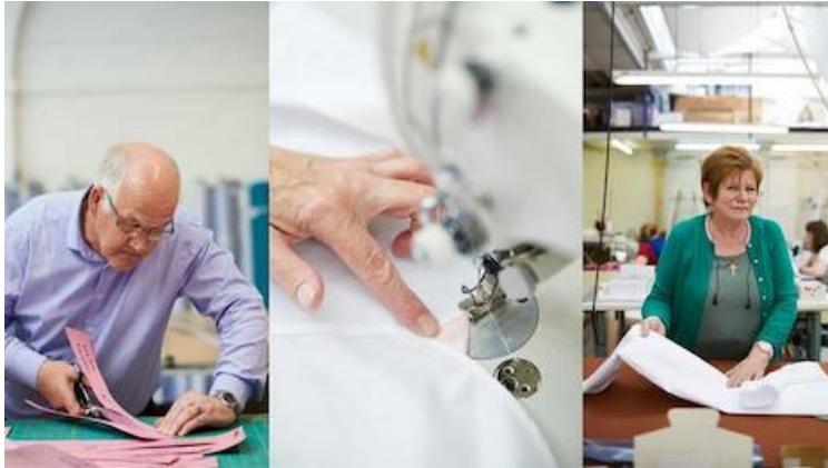
Thomas Pink's "Meet the Shirtmakers" campaign.

Similarly, British fashion house Thomas Pink took consumers inside the workshop where its shirts are made in a second short video.