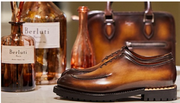
Berluti's Women's Capsule Collection

This trend does not exist solely for fashion, it extends to retail as well.