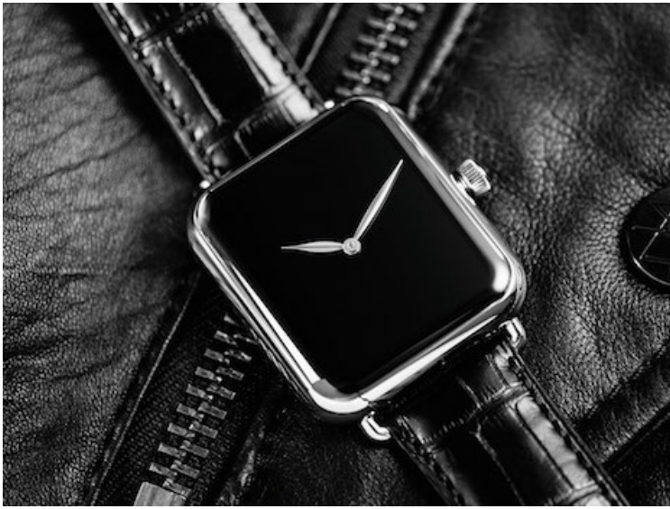
The Swiss Alp Watch Zzzz.

Apple's event on Sept. 12 showed that the consumer electronics maker is continuing to be a threat to luxury, with both a new ultra-premium model of iPhone and the announcement that Apple Watch has surpassed Rolex as the most-popular timepiece in the world.