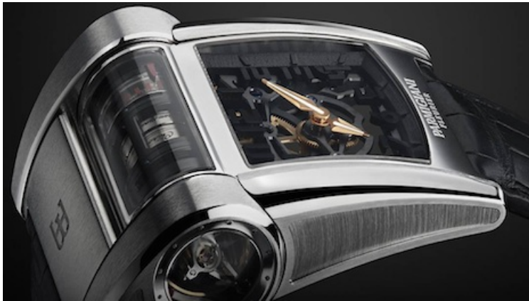
The Bugatti Type 390 is modeled after the Bugatti Chiron.

Bugatti's Chiron is the latest supercar from the auto manufacturer and comes with an impressive list of specs. Parmigiani is hoping to capture the attention of some of Bugatti's enthusiastic customers by releasing a commemorative watch that is meant to act as a companion to the car itself ( see story ).