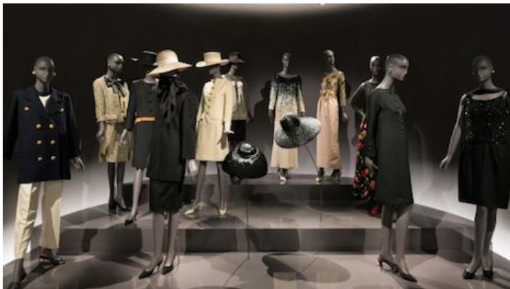
Musee Yves Saint Laurent Paris Open House Day, Oct. 1, 2017.

"Christian Dior and Granville: The Source of a Legend" opened at the Christian Dior Museum in Granville on April 8 and was featured at the museum until Sept. 24. The exhibition is part of the brand's ongoing 70th anniversary celebrations ( see story ).