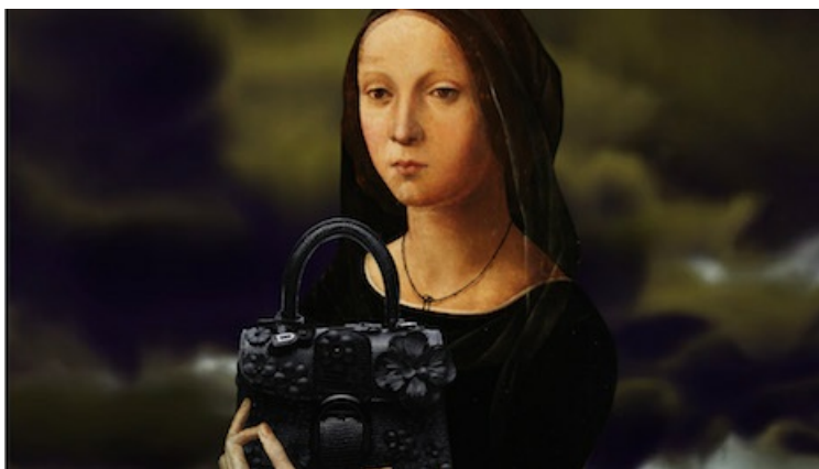
Still from Nic Courdy's animation featuring Delvaux's Black Beauty handbag.

In addition to fine art, popular culture can also serve as an inspiration for luxury designs, such as the HBO television series "Game of Thrones" did for Delvaux.