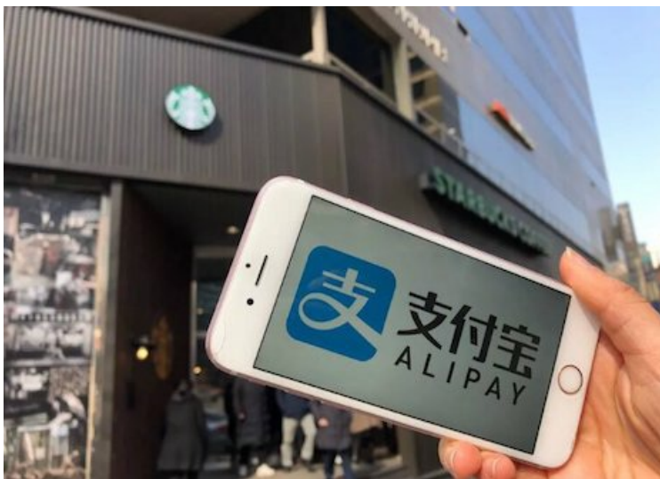
Alipay is accepted at Starbucks.

When traveling overseas, more than 90 percent of Chinese tourists will use mobile payment platforms if the option is available, according to a report from Nielsen and Alipay. While Chinese consumers are more digitally savvy than other travelers, mobile pay also eases the difficulties that can come with language barriers and other issues from traveling abroad ( see story ).