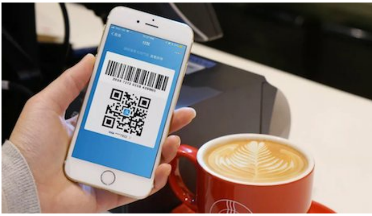
Alipay makes it easier to pay through mobile devices.