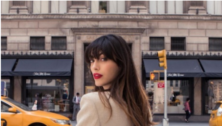
Exterior of Saks Fifth Avenue.

Saks had a data breach, while Neiman Marcus agreed to settle with those affected by a 2013 credit card information leak. As ecommerce becomes more of a common practice for affluent consumers making high-end purchases, cybersecurity measures will need to be a priority for luxury brands ( sees story ).