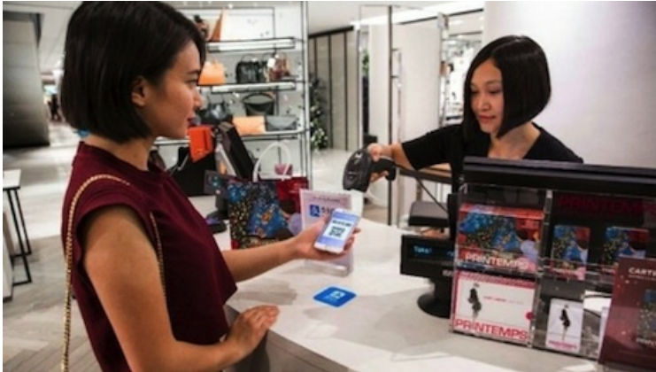
Paying in stores is changing.