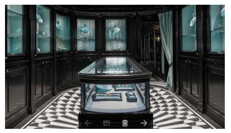
Gucci unveils its high jewelry collection, sold in its Place Verdme boutique.

Italian fashion label Gucci moved further into jewelry with a new high line inspired by creative director Alessandro Michele.