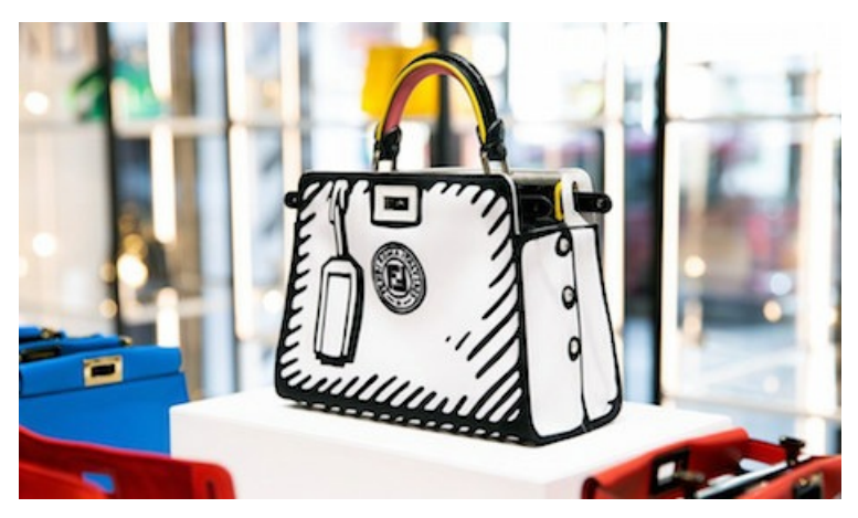
Fendi takes up space in Harrods with Joshua Vides.

Here are the top five brand moments from last week, in alphabetical order: