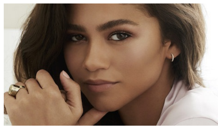
Zendaya, the new face of Idle by Lancme.

The Hortus Deliciarum collection will only be sold in the new Place Vendme boutique and will be comprised of 200 mostly unique pieces. It will be comprised of three chapters, each with their own distinct themes representative of Garden of Eden, Arcadia, Xanadu and Gucci itself (see story).