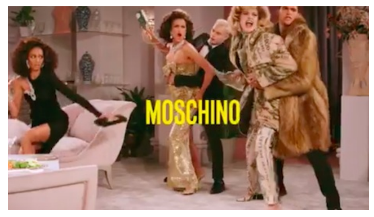
Moschino stirs drama for fall