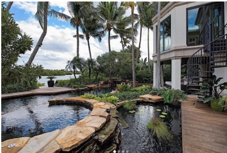
Luxury home for sale in Naples, Florida.