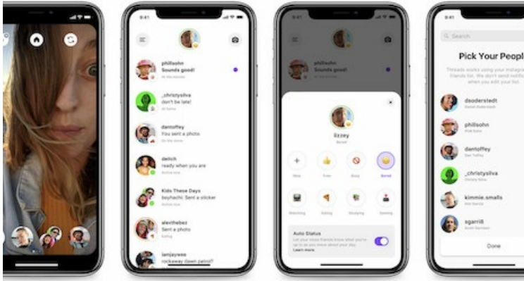
Threads social commerce app.

Ordering bath gel and perfume is as simple as adding to a cart, particularly among loyal customers who are ordering a classic fragrance. Everyone knows what Chanel No. 5 smells like, so an in-store visit is not required.