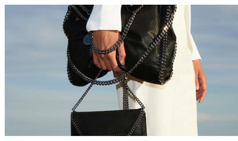
Stella McCartney sets sail with Starboard and Celebrity Cruises.