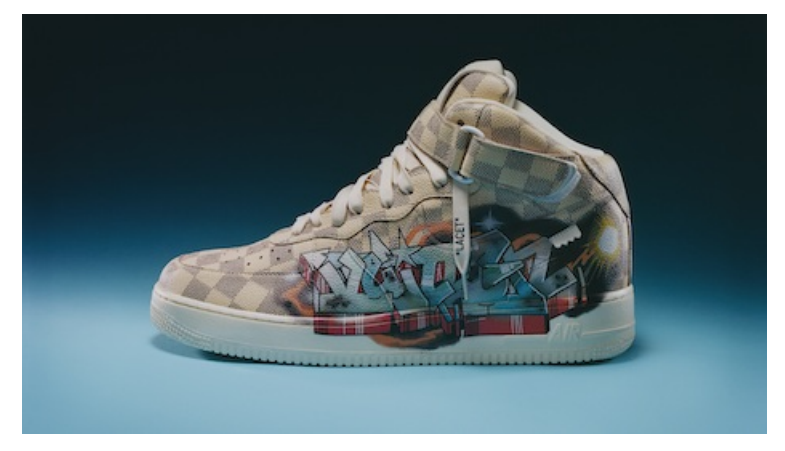
One of the Louis Vuitton and Nike Air Force 1 mid-top designs.

The nine editions for the release are part of the 47 bespoke sneakers Mr. Abloh designed as part of the collaboration.