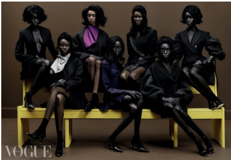
In a British Vogue first, nine African models featured on the cover of the February 2022 issue. Seen in this picture are seven models.

"We are working to acquire and retain these new customers by demonstrating our fashion authority and delivering the elevated, seamless cross-channel experience for which Saks Fifth Avenue is known."