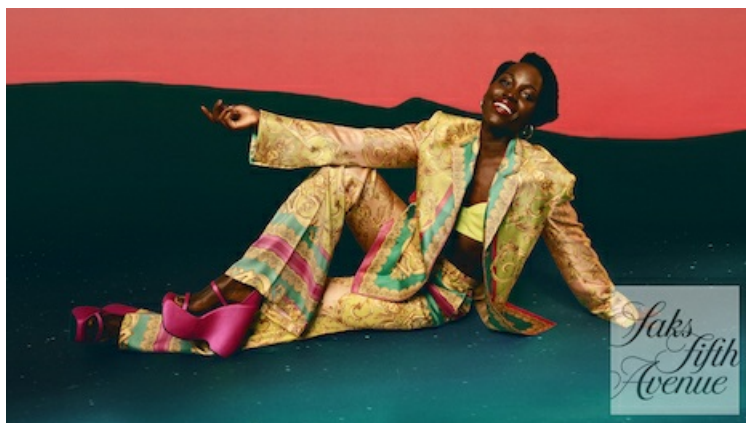
Saks' spring 2022 campaign starring Lupita Nyong'o.