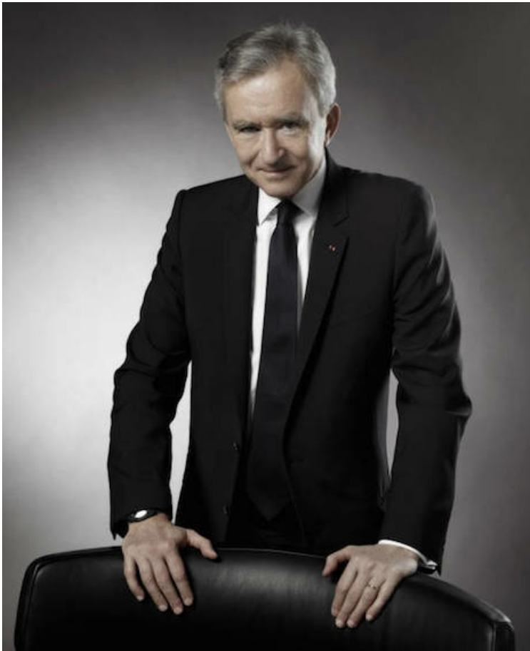
Bernard Arnault is chairman/CEO of LVMH

Luxury Personality of the Year: Bernard Arnault , chairman/CEO, LVMH